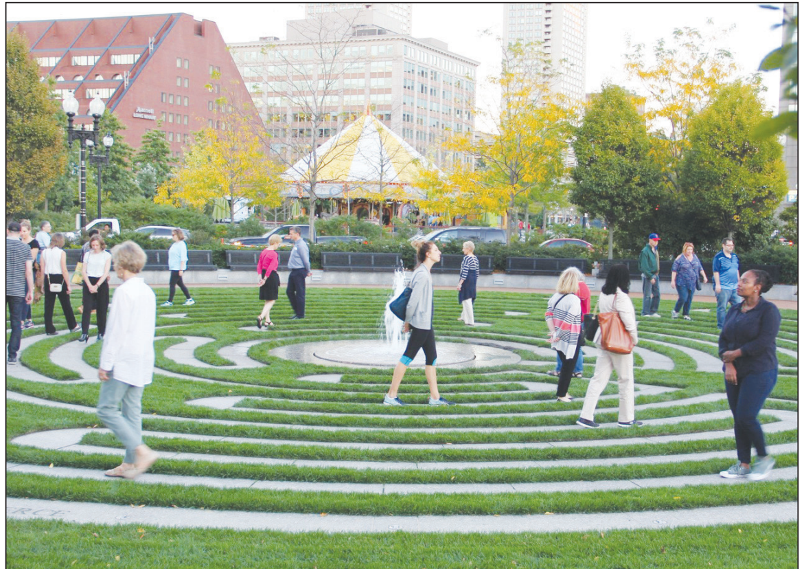
Artist rendering of residents walking along the Labyrinth in the Armenian Heritage Park.

On this day, a reminder that even in a busy city, a simple walk can engage many around the world, all coming together towards building a world of peace and harmony.