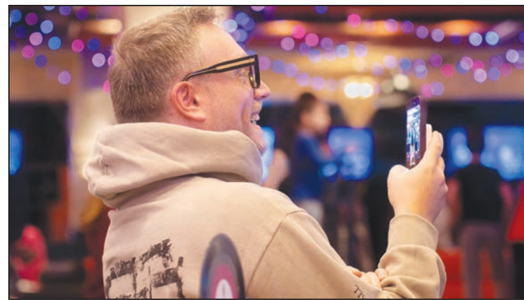
Proud parent in the audience.