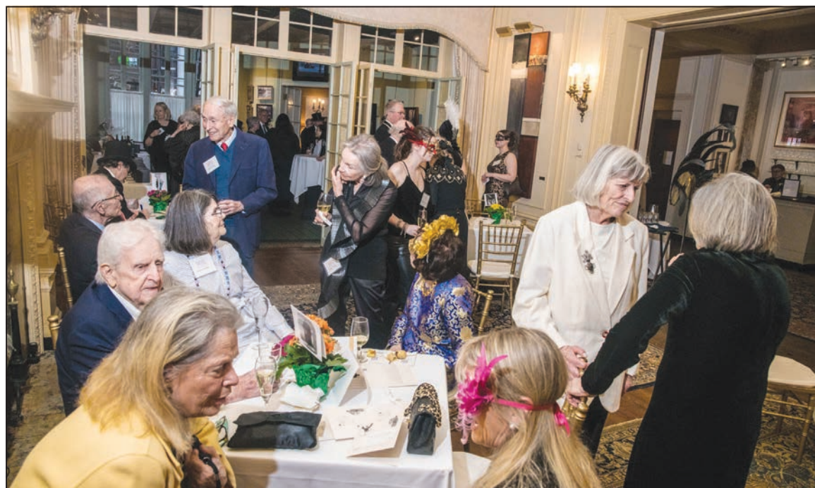
Guests enjoyed the ambience of the St Botolph Club that lent to the Edward Gorey theme of the party.