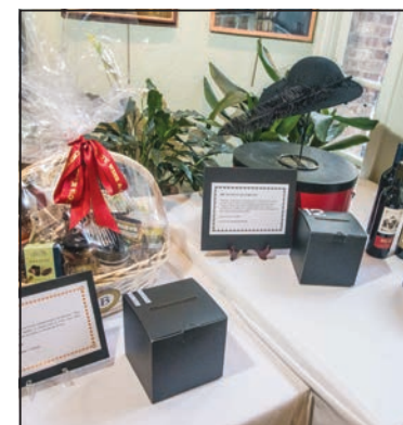
Raffle items, shown above, await for guests to buy tickets for them.