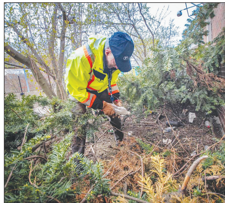
Shown (above and below) are some of the employees from the MBTA and MassDOT who volunteered to cleanup eight stations along the MBTA Blue Line

fleet modernization and mode shift investments across bus and commuter rail. The agency continues to deploy hybrid and battery-electric buses and invested in supporting infrastructure like the fully funded Arborway battery-electric bus facility.