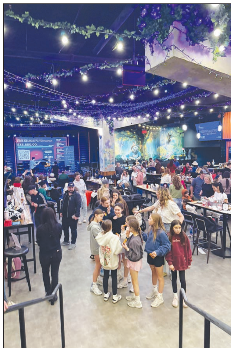
Families and students attending Performathon.

NEMPAC is a nonprofit 501(c)(3) community music school and performing arts center, founded in 2001 to expand access to high-quality arts education. Each year, NEMPAC serves over 2,900 students and community members through regular lessons, classes, and partnerships with Boston schools. Through its concerts and professional productions—including many free programs such as Jazz in the Park and Opera on the Prado—NEMPAC advances equitable access to the arts while supporting a vibrant network of local artists.