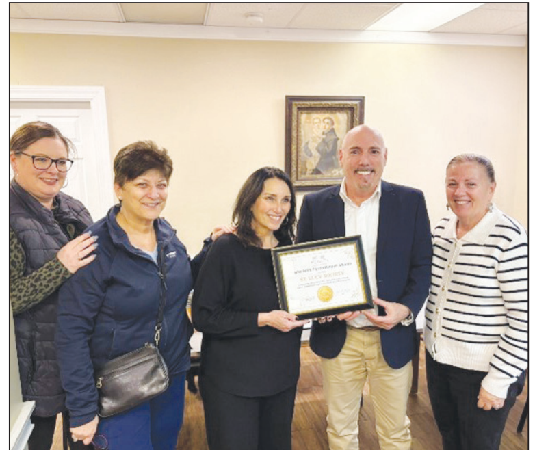
Members of St. Lucy Lucy Society are shown receiving NEW Health Partnership Award.

More information and links to purchase tickets can be found online at: thewestendmuseum.org