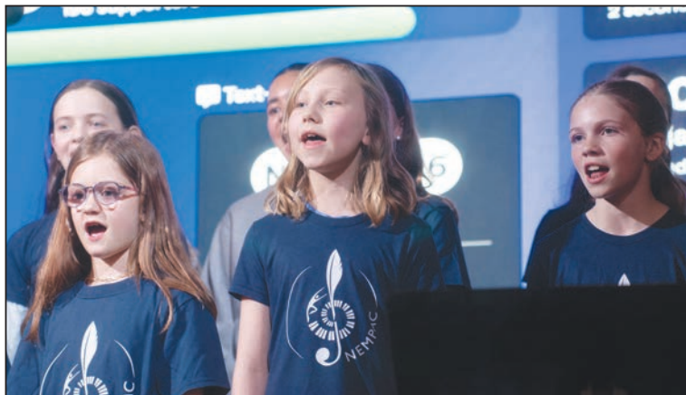
Cast of High School Musical.

More than 120 NEMPAC student performers, ranging in age and experience from young beginners to adult learners, took the stage throughout the day-long fundraiser. Representing NEM-